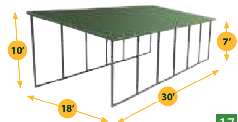
Example shown: 18x30x10x7

Note: Sizes shown for example only, not to scale.