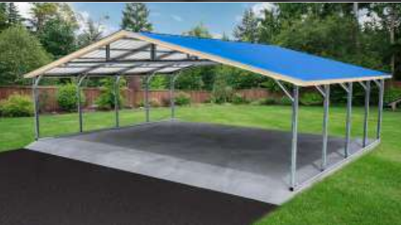
VERTICAL ROOF STYLE

Triple wide carport features include the following: 14 gauge galvanized steel framing, 29 gauge metal roofing with twenty year Beckers paint system, framing spaced 5' on center. Includes roof trusses and leg braces for additional strength and stability. Concrete anchors, rebar anchors, and mobile home anchors are included in base price. Base leg height is 6' tall. Please note: Eagle Carports does not provide site work.