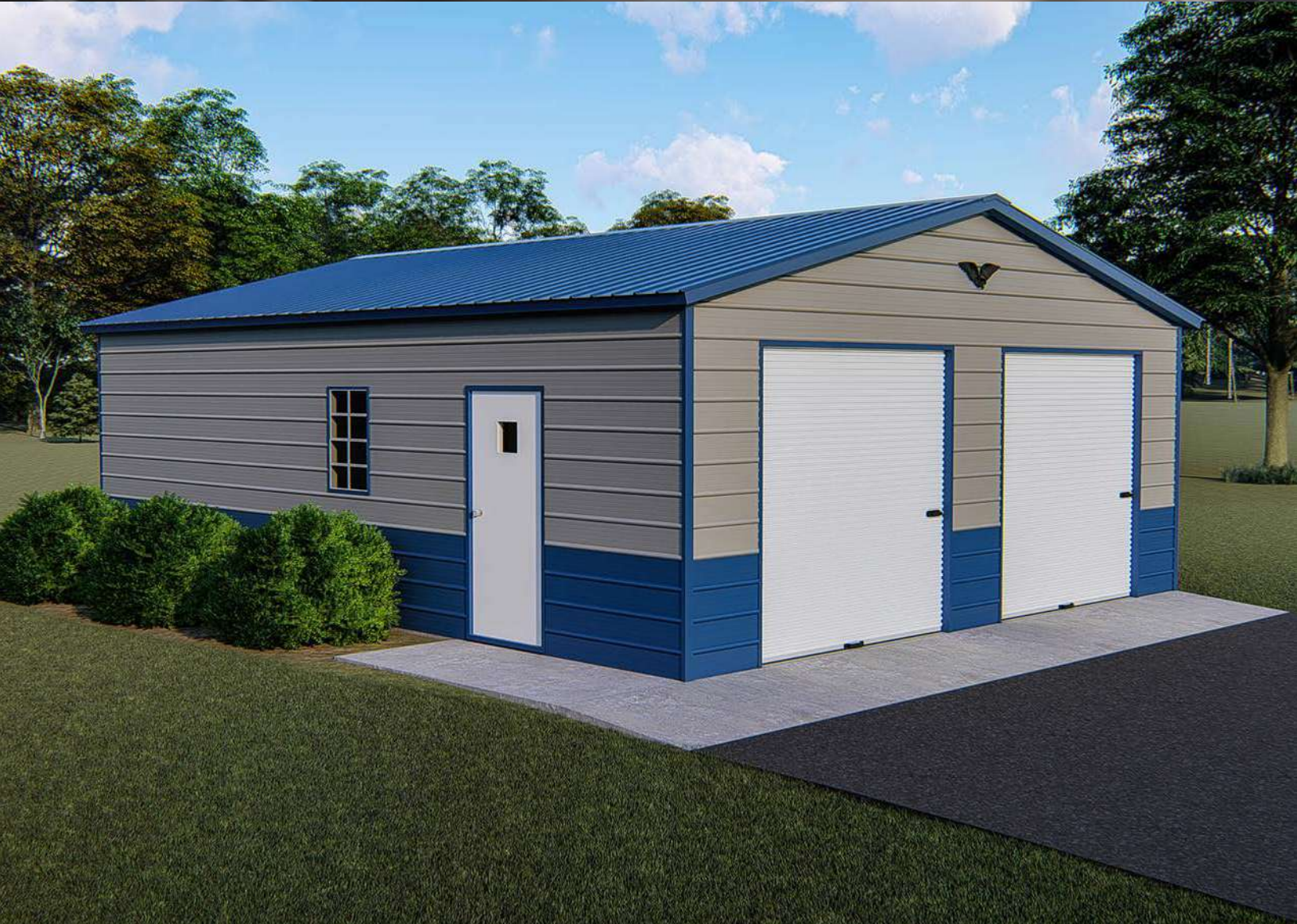
Image shown features horizontal wainscoting.

Garage package features include the following: 36"x80" walk-in door, two 24"x36" windows, listed garage doors, 14 gauge galvanized steel framing, 29 gauge metal roofing with twenty year Beckers paint system, framing spaced 5' on center and includes both roof and leg bracing for additional strength and stability. Concrete anchors or mobile home anchors are included in base prices for units. Base leg height is 9' tall. Please note: Eagle Carports does not provide site work.