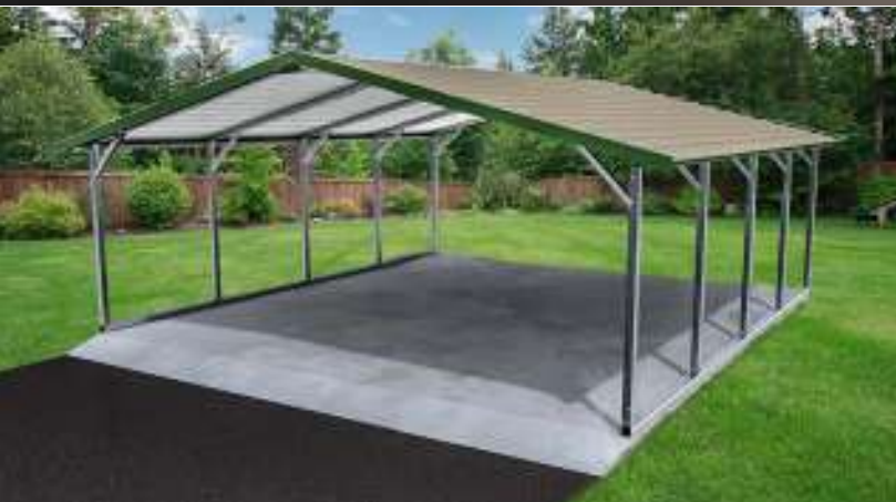
BOXED EAVE ROOF STYLE