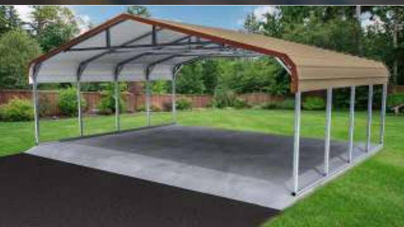
REGULAR ROOF STYLE