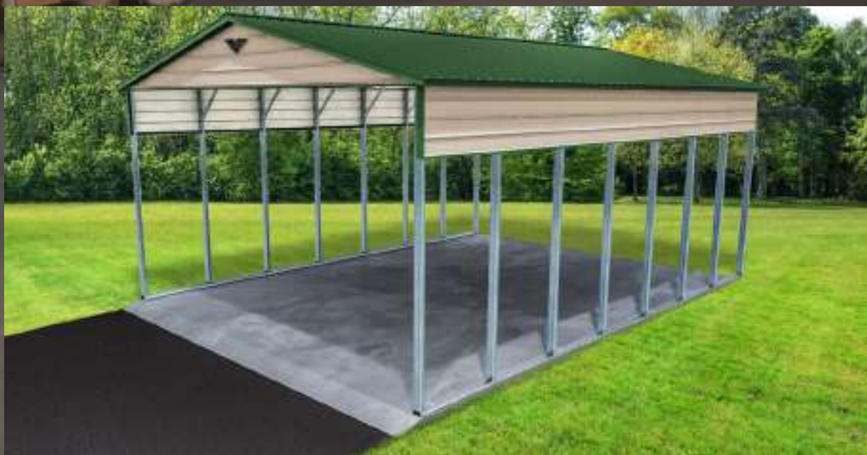
Image shown features additional options such as gables, J-trim, and one panel on each side not included in base price.