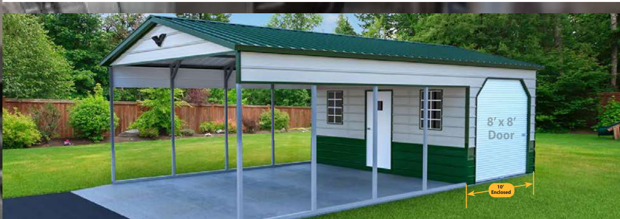
Image shown features horizontal wainscoting, gable, half panels, 45° trim kits, and J-Trim not included in base price.

Every extra 5' of storage adds $175 to total (based on 9' legs)