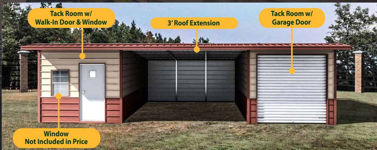
Image shown features additional options, including wainscoting, roof extension, window, and tack rooms.