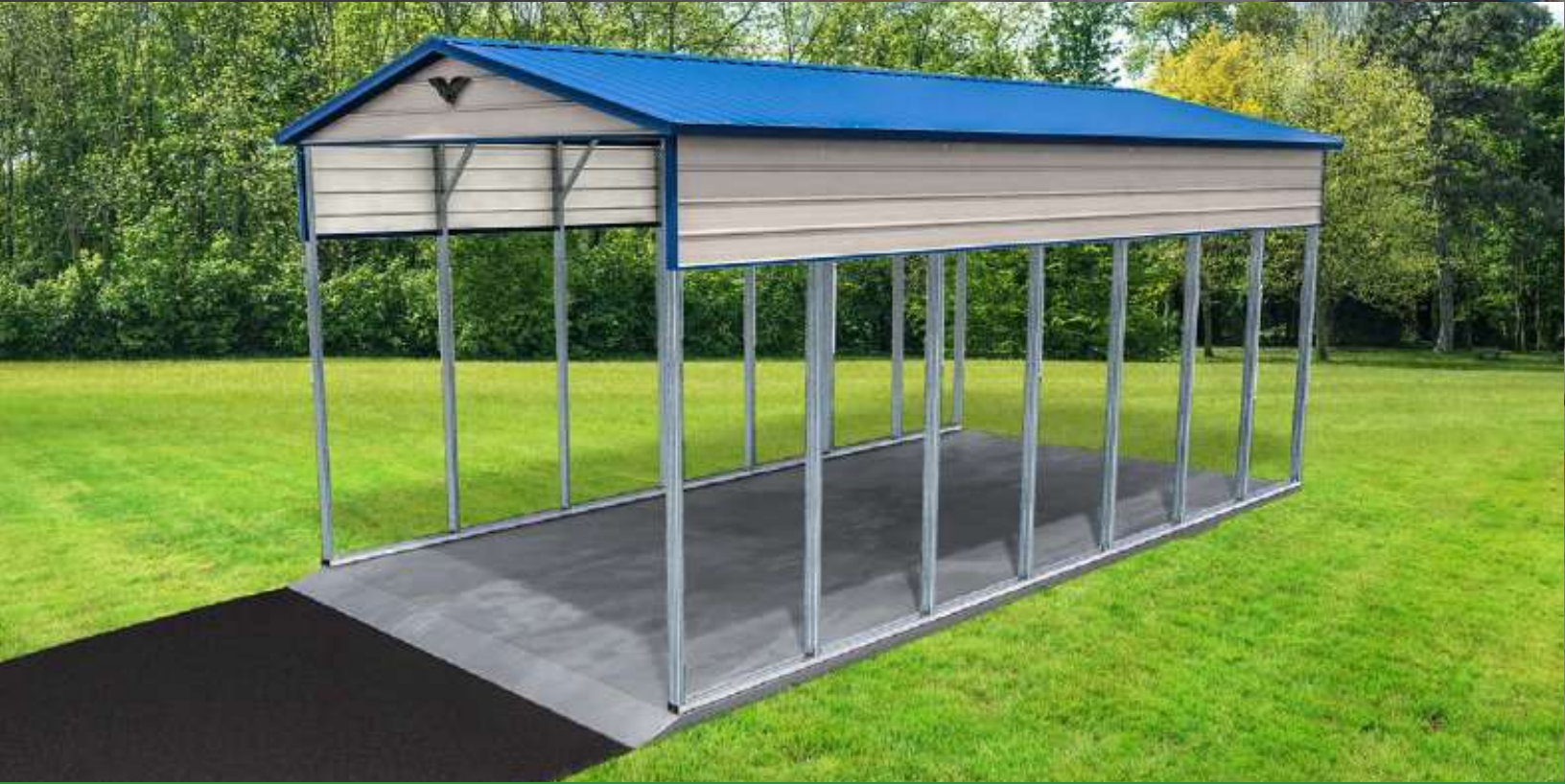
Image shown features additional options such as gables, J-trim, and one panel on each side not included in base price.

Standard RV carport features include the following: 14 gauge galvanized steel framing, 29 gauge metal roofing with twenty year Beckers paint system, framing spaced 5' on center, double base rail, double legs, includes both roof and leg bracing for additional strength and stability. Concrete anchors or mobile home anchors included in base price. Base leg height is 14' tall. Please note: Eagle Carports does not provide site work.