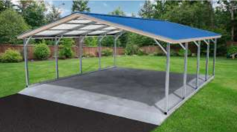
VERTICAL ROOF STYLE

Standard carport features include the following: 14 gauge galvanized steel framing, 29 gauge metal roofing with twenty year Beckers paint system, framing spaced 5' on center. Includes both roof and leg braces for additional strength and stability. Concrete anchors or mobile home anchors are included in base price. Base leg height is 6' tall. Please note: Eagle Carports does not provide site work.