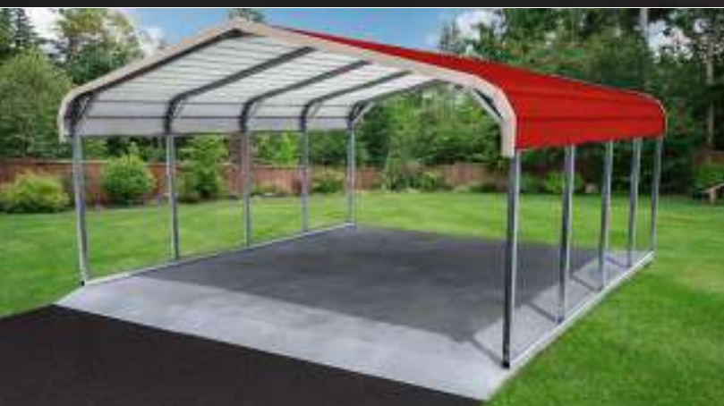
REGULAR ROOF STYLE