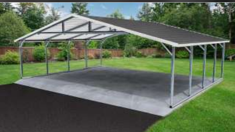
BOXED EAVE ROOF STYLE